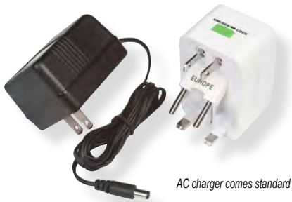
AC charger comes standard with adapter for international plug configurations.