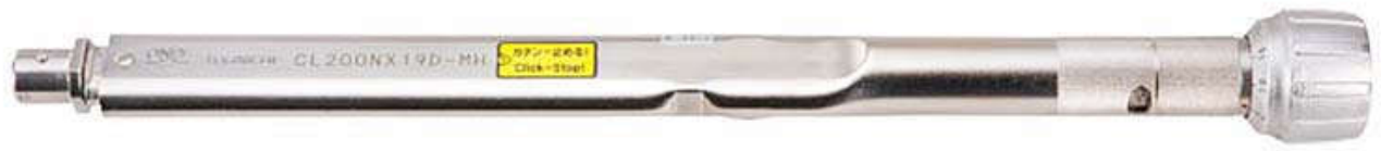
CL200NX19D-MH [Overall length 455 mm]