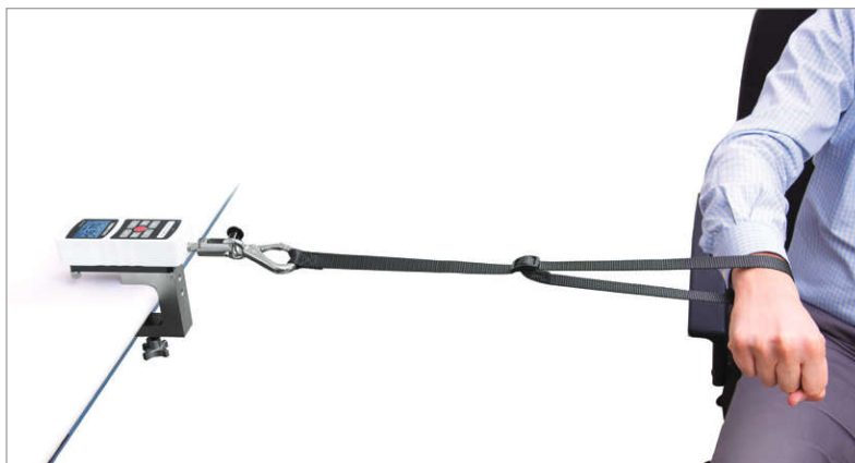
Force gauge shown in a horizontal orientation