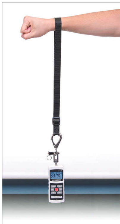
Force gauge shown in a vertical orientation

Force gauge displays real time force reading, peak force, and pass/fail indicators. The load cell shaft may be oriented in the up or down position, as demonstrated in the images below.