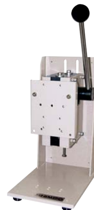
FGS-50S Lever Test Stand