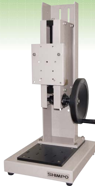
FGS-100H Hand Wheel Test Stand

Nearly all manufacturers' gauges are compatible with Shimpo's test stands for incredible versatility. These stands are designed for precision, balance, and durability. Therefore they are perfectly suited for measuring a limitless range of materials such as, wire, spring, plastic, paper cord, tubing, glass and composites.