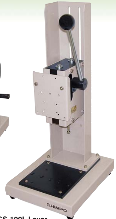
FGS-100L Lever Test Stand