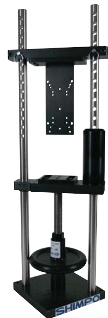
FGS-1000H Hand Wheel Test Stand