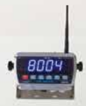
MSI-8004 HD LED Remote Display